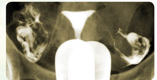
Dye spills out the ends of tubes.